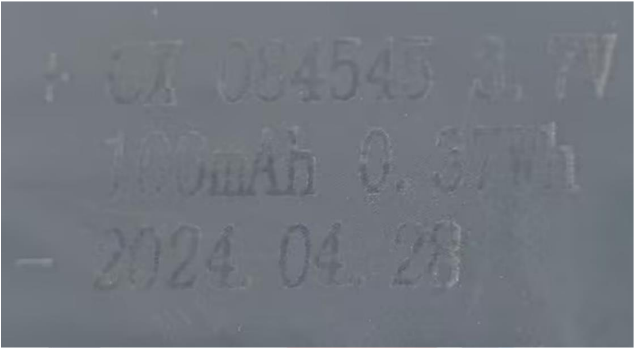
Picture 3. Label view 图片 3. 标签视图